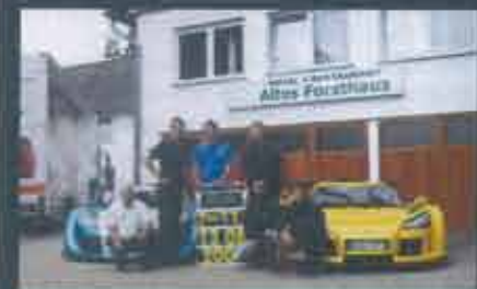
The Gumpert team celebrate their recent supercar lap record, set with an Apollo Sport

Production car Nürburgring lap times can be pretty confusing. Although it is generally agreed that the cars must be in showroom trim and on standard tyres, there is no official body that oversees the attempts and records the times. There's an added problem in that the start and end points of the lap to which the times typically refer are not in the same place, so a stopwatch at the public entrance on the Döttinger-Höhe straight won't give you an instant time. This is because the bulk of the times are set during industry pool days when it would be dangerous to pass the old pit exit at full speed. Accordingly, the lap starts at the old pitlane exit and ends just after the final corner, missing out the 200 metres or so of the old pit straight, so this section has to be deducted from the data later.