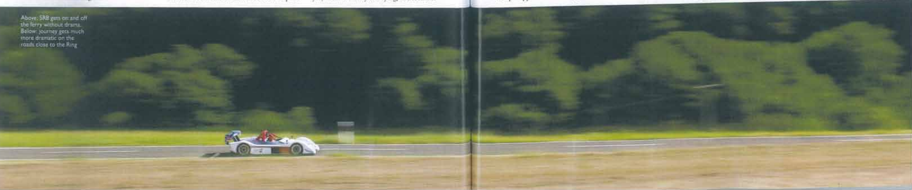
Above: SR8 gets on and off the ferry without drama. Below: journey gets much more dramatic on the roads close to the Ring

Watching record-breaking runs here is an exercise in patience. I was here last year with Black Falcon and their supercars (evo 123) and